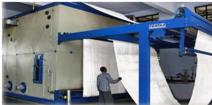
Dyeing, Tumbling and Fabric Inspection