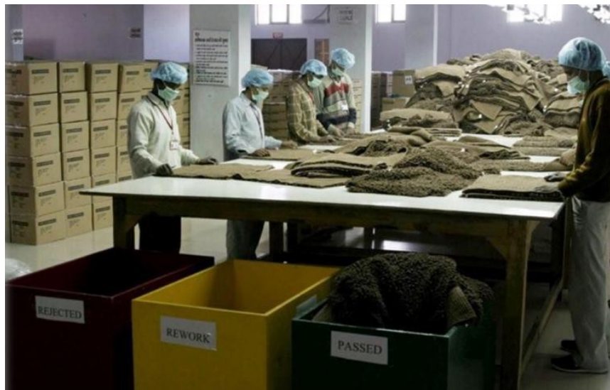
Finishing and Passing