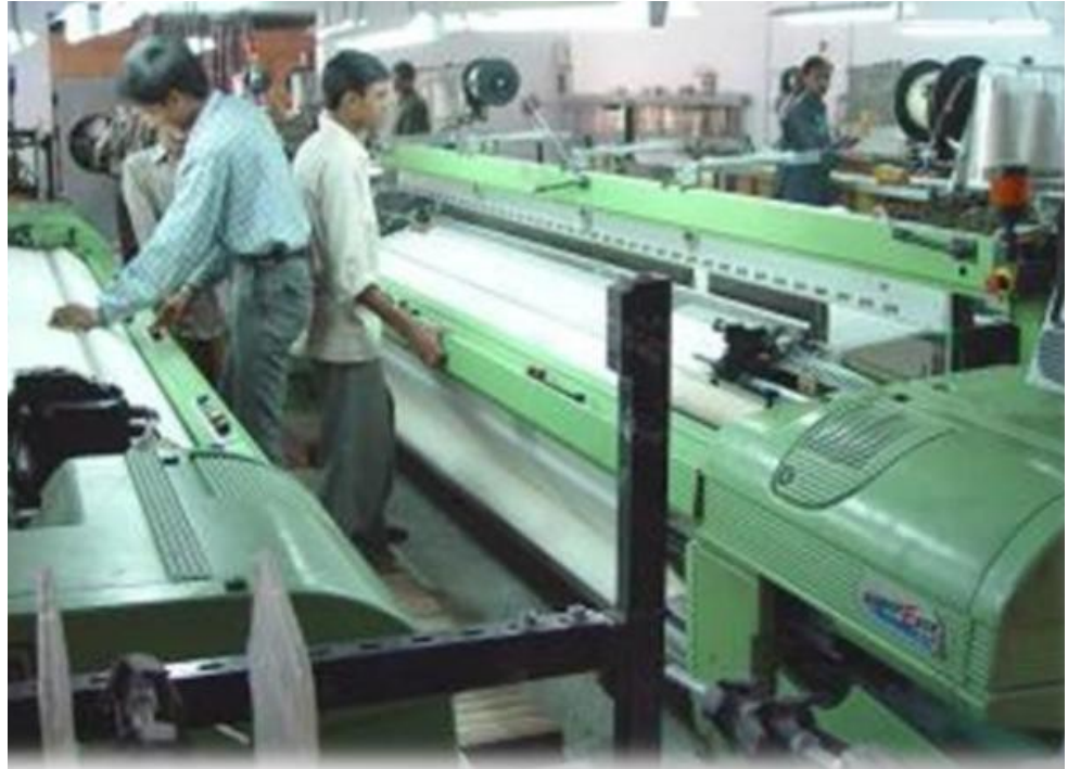
Weaving - From Traditional Handloom to Shuttle Less Looms