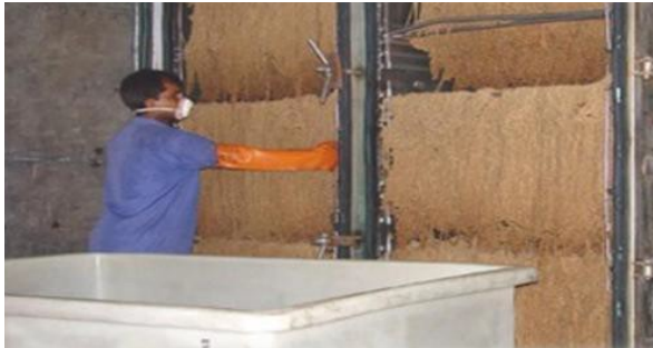
Embroidery/Pit Loom-Manual Embroidery & Pit Loom