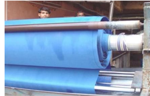
Dyeing: Yarn Dyeing, Fabric Dyeing, Piece Dyeing